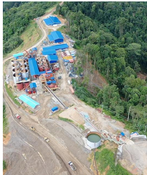
Aerial view of the Mill Plant Site of the Balabag Gold Project on February 2, 2021.