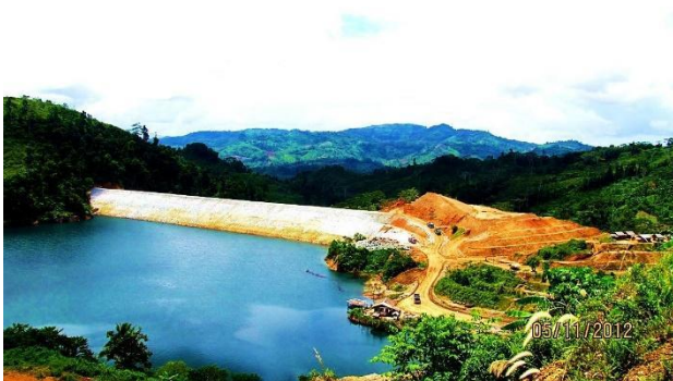
Canatuan Tailings Storage Facility – November 2012.

As at the date of this MD&A, Canatuan is in the process of completing its final rehabilitation activities under the supervision of the Multi-Partite Monitoring Team (“MMT”) that includes members of the Local Government Units (“LGU”), representatives of the local community, the municipal and provincial government, and the DENR (as representatives of the national government).