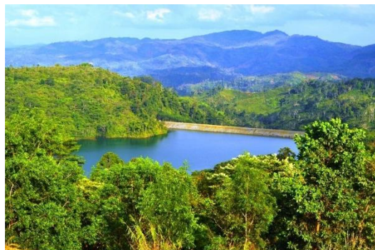
Canatuan Tailings Storage Facility – June 2020

TVIRD is currently focused on maximizing its valuation, which would also maximize its investment value for TVI, by focusing on the following areas of growth: