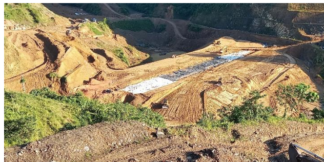
Views of the TSF on May 11, 2021.

The TSF is being constructed in stages to accommodate progressively increasing resources as they are defined. It is expected that tailings deposition in the first phase, Stage 1, will commence in June 2021 with the commissioning and operation of the processing plant. Completion of the TSF is a critical path item.