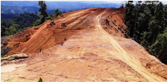
Aerial view of Mill Plant Site of the Balabag Gold Project in August 2019.

Development works at Balabag have continued to progress as reflected in the following photos: