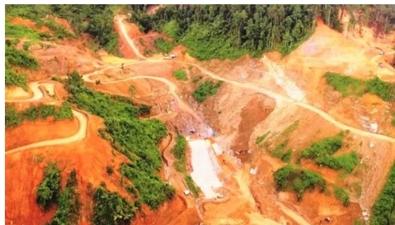
Views of the TSF on June 11, 2020.