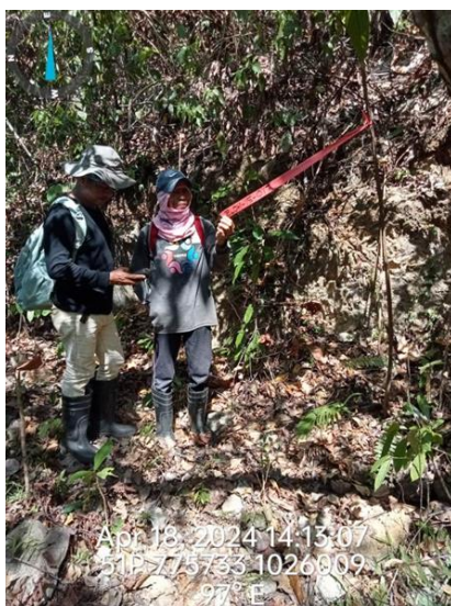
Clearing trails leading to the drill hole locations at the Agata Limestone Project (April 18, 2024)

The proximity of the limestone project to AMVI's private port enhances logistical efficiencies, offering significant strategic advantages in terms of export and distribution capabilities. This logistical benefit, combined with the high potential of the limestone deposits, positions the Agata Limestone project as a key component of TVIRD's portfolio aimed at diversifying its product range and enhancing its market footprint.