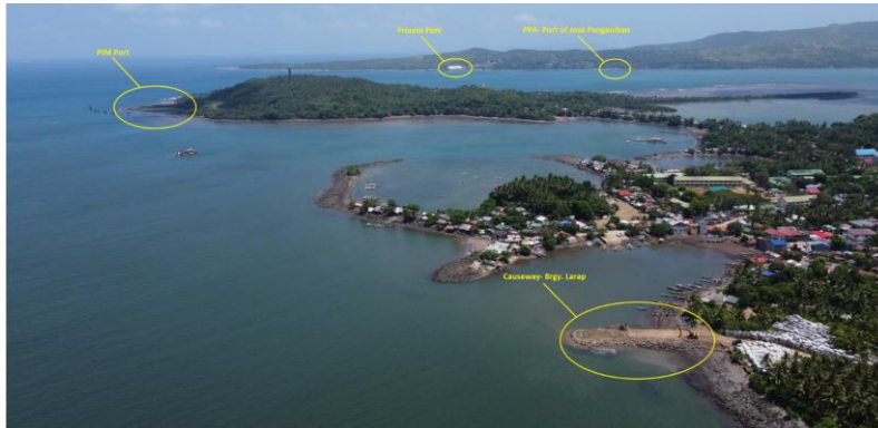
Aerial views of port/ causeway options being considered for the Mabilo Project (April 29, 2024)

The Nalesbitan project, located within the same Mineral Production Sharing Agreement (MPSA) as the Mabilo project, offers TVIRD a 60% indirect interest through its ownership of MLEDC. This MPSA is valid until June 2041. Positioned 15 kilometers west of Mabilo in the historic Paracale Gold District of Eastern Luzon, Nalesbitan is part of a well-known mining region with a rich history of gold mining.