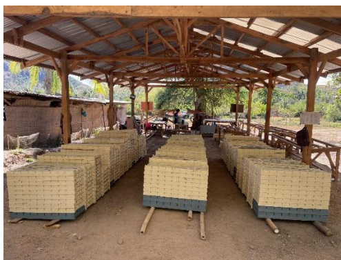
Core boxes stacked at Looc core logging area Pan de Azucar, May 6, 2024

In October 2023, TVIRD, through its wholly owned subsidiary EDCO, initiated a 60-day resource drilling program to validate and expand the known pyrite mineralization, which also includes copper, zinc, gold, and silver. The planned program included 31 new exploration drillholes totaling 3,040 meters and the redrilling of 3 old drillholes for 240 meters for metallurgical studies, aiming for a combined drilling of 3,280 meters. As of the writing of this MD&A, 1,548 meters have been drilled, comprising 15 new drillholes and the redrilling of 2. However, drilling activities were halted prematurely due to a Cease-and-Desist Order (CDO) issued by the Iloilo provincial government on March 4, 2024 due to allegation of arsenic contamination. As a result, all drilling and field operations are currently suspended, and the exploration team has shifted focus to logging the drill cores. Half of the core samples were shipped to Siana and Balabag for Au, Ag, Cu, Zn, Fe and S analysis. Results are still pending.