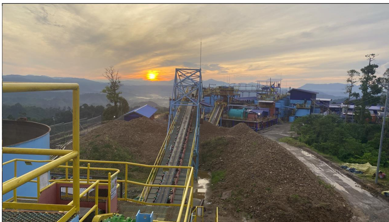
Balabag Gold & Silver Project process plant (June 23, 2024)