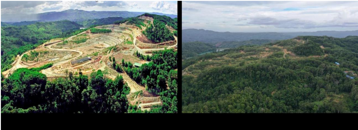
Canatuan Mine (Before Rehabilitation) – 2015.

As of the latest MD&A, final rehabilitation efforts at Canatuan are ongoing, overseen by the Multi-Partite Monitoring Team (MMT). This team comprises representatives from the local community, municipal and provincial governments, and the Department of Environment and Natural Resources (DENR), ensuring that the closure activities meet the highest standards of environmental care.