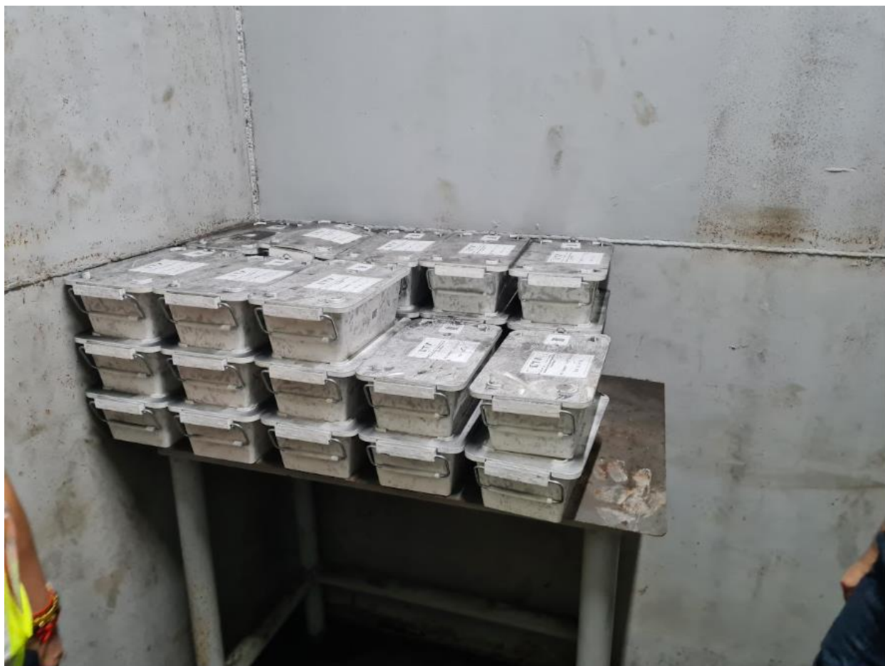
Dore boxes in Balabag Gold & Silver Project gold room awaiting pickup (July 26, 2024)

The average processing rate at the Balabag gold processing plant in the six (6) months ended June 30, 2024, was 2,112 t/d while plant availability was 91%. Head grades for the six (6) months ended June 30, 2024, averaged 1.6 g/t Au and 35.31 g/t Ag with recoveries at 94% for Au and 78% for Ag.