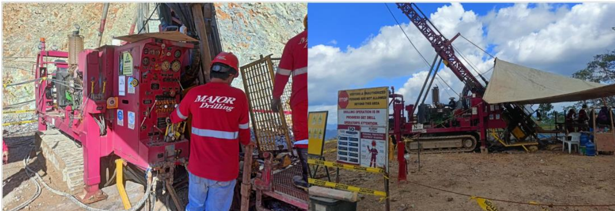
Resource expansion drilling program (July 26, 2024)

TVIRD has completed the Phase 7 and 8 resource drilling programs at Balabag Hill. A total of 91 holes with cumulative meterage of 10,013 were drilled as of July 26, 2024. The drilling program aimed to delineate additional resource at Miswi, Main Tinago and Lalab areas. Almost 50% of the total meterage were focused on defining the down dip extension of the Miswi orebody. The deepest hole targeting the Lalab deep-seated veins reached 499 meters from surface. Overall, the average drilling depth is 100 meters. The resource drilling program commenced in February 2024 with EDCO and Major as the drilling contractors.