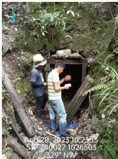
The identification and mapping of small-scale mining operations in Barangay E. Morgado

AMVI is actively monitoring developments related to a promising nickel prospect located in the Gupana-Omasdang area on Dinagat Island. This area is under consideration for its significant potential to support AMVI's strategic expansion in nickel mining.