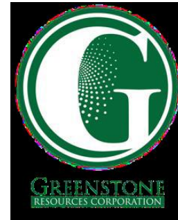
Greenstone Resources Corporation a 100%-owned TVIRD entity

TVIRD owns 100% of Siana through its 100%-owned subsidiary, GRC. The mine covers a 3,289 hectares (“ha”) MPSA (MPSA No. 184-2002-XIII) in addition to 100% of the neighboring 1,482 ha MPSA No. 280-2009-XIII for the Mapawa Project and the Ferrer Claim (as covered by the Application for Mineral Production Sharing Agreement No. A000046 and comprising of one Block of 595 ha). The Siana MPSA was granted on December 11, 2002, and registered with the Philippine Mines and Geoscience Bureau (“MGB”) on December 27, 2002, for a term of 25 years.