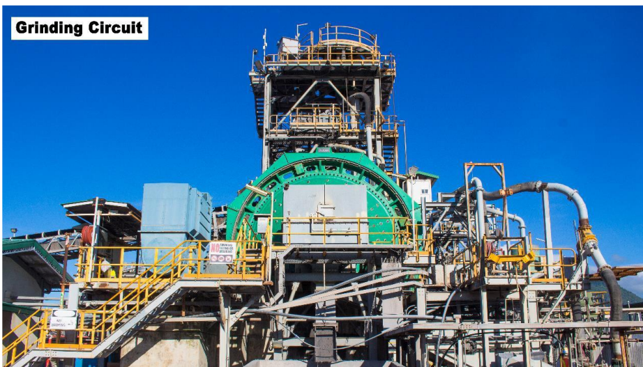
Siana Gold Grinding Circuit, April 5, 2023.