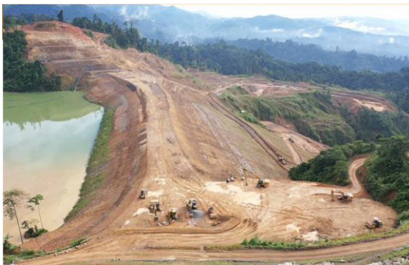
Stage 3A was completed on May 13, 2023, at an average elevation of RL 475.308 meters.