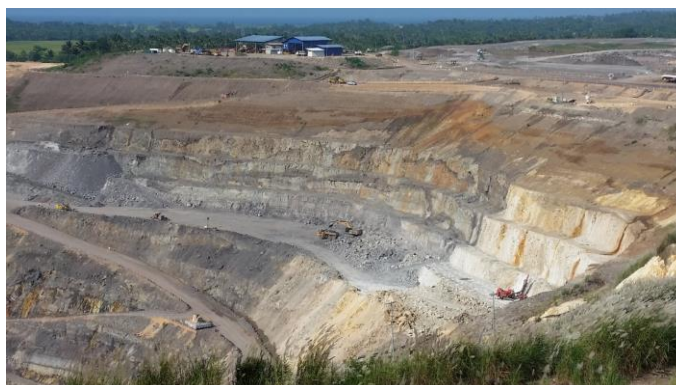
Mining west wall at Siana Gold Project.

In the Red 5 Annual Report at June 30, 2020, and due to what Red 5 has reported as pending construction of additional tailings storage capacity, no updated JORC 2012 reserve estimate is reported for the Siana open pit as at that date. As such, Red 5 has reported the open pit mineral resource and reserve estimate as at June 30, 2020 to be: