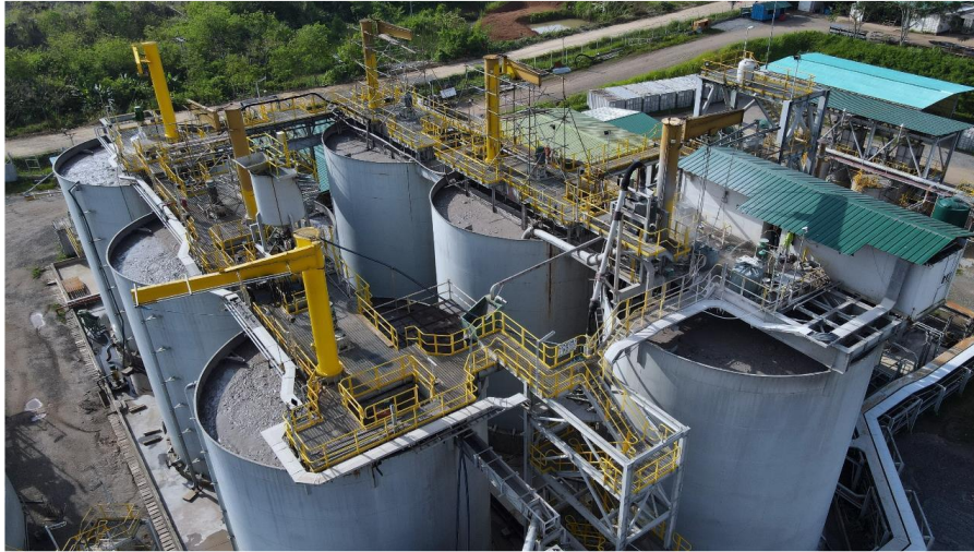
Siana Gold CIL tanks, April 5, 2023