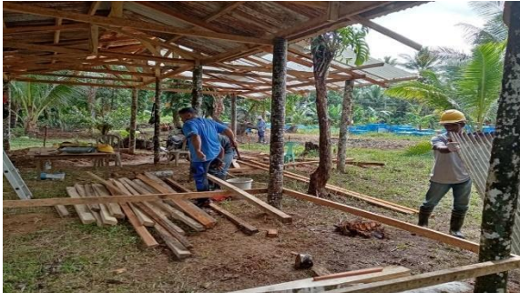
Construction of core house on October 25, 2022.

TVIRD is currently proceeding with various organizational, community-related, permitting and site clean-up matters while considering next steps at Mabilo. On May 23, 2023, TVI announced that TVIRD and SageCapital have signed a binding agreement (the “ Agreement ”) with RTG with respect to an agreed restructuring of Mabilo. The Agreement provides the opportunity to now focus on finalizing the remaining permitting matters and financing plans for Mabilo, together with surface rights, following which a commitment to development is expected to be formalized by the Board of MLEDC.