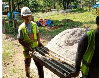
Core house activities at Mabilo – May 15, 2023

Additional information related to the Mabilo Project may be found on the TVIRD website at https://tvird.com.ph/ .