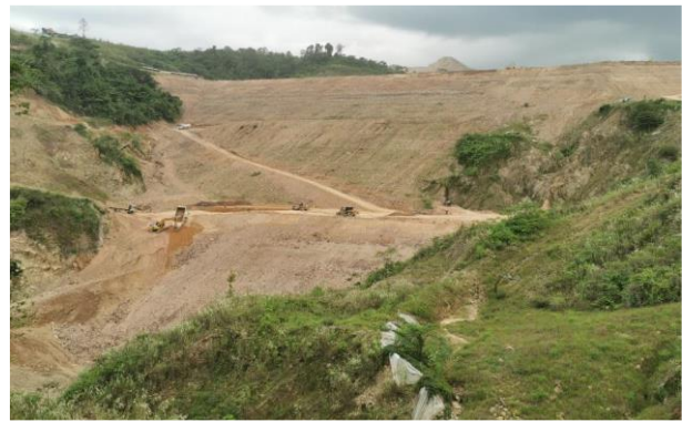
Balabag TSF construction: Ongoing placement of Zone 3A material at Stage 3B and spillway excavation on May 20, 2023.