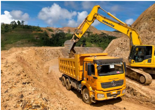
Excavation of Stage 3B spillway.