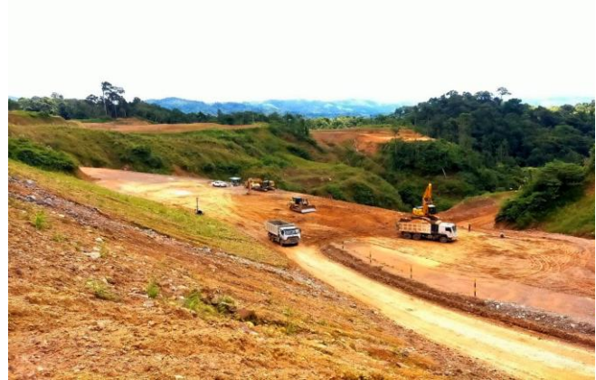
Balabag TSF construction: Stage 3B embankment placement. Photo: July 2023.