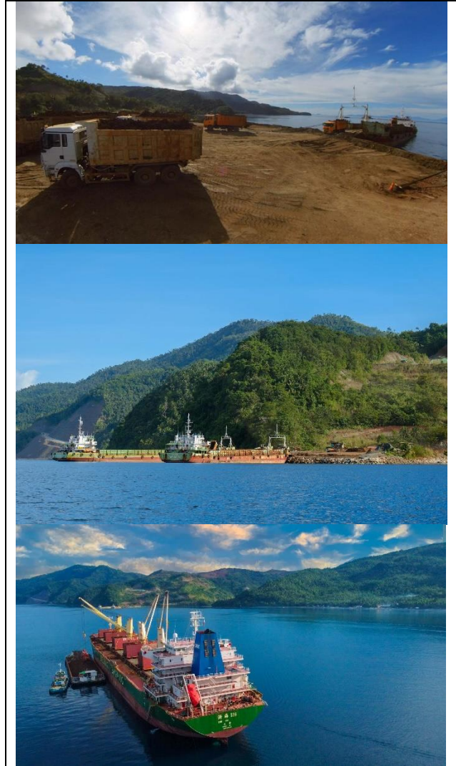
The sequence of shipping at the Agata direct shipping nickel/iron mine.

TVIRD is continuing to review potential nickel laterite projects, near to AMVI, for possible acquisition and the Assay Laboratory at site is being used for the purpose of analyzing samples gathered from these properties.