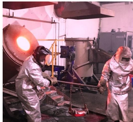
Ongoing gold pour at Balabag.